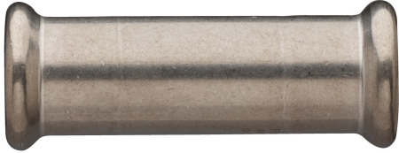
Manicotto passante F/F.