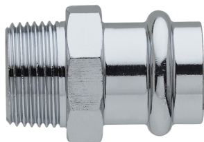
Manicotto femmina filettato maschio.