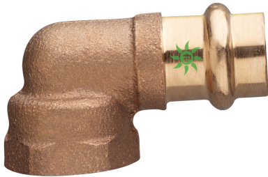
Gomito femmina filettato femmina.