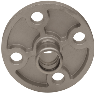
Manicotto flangiato femmina PN6.