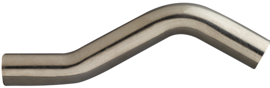
Scavalcamento corto maschio.