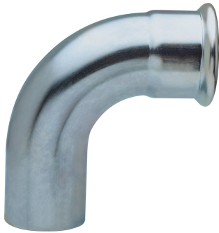
Courbe 90° M/F.