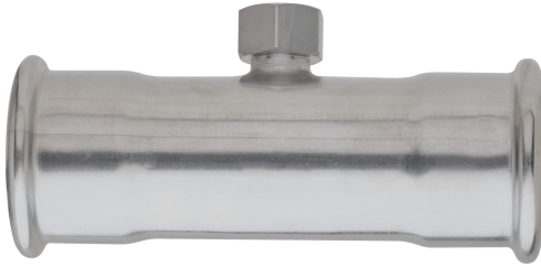
Té F/filetage femelle/F.