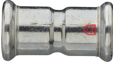
Manchon avec flexion F/F.