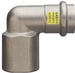
Coude F/filetage femelle.