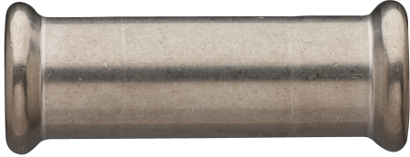
Manchon coulissant F/F.