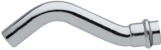
Clarinette M/F en cuivre.