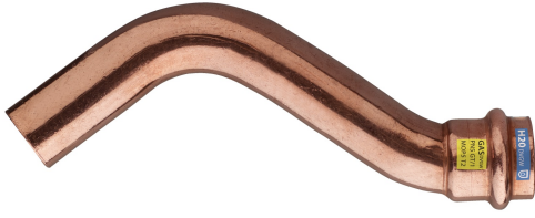
Clarinette M/F en cuivre.