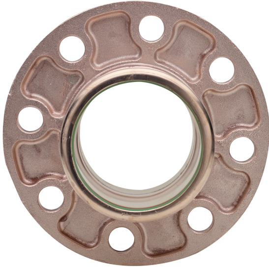
Manguito bridado PN10/16.