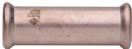
Manguito de paso.