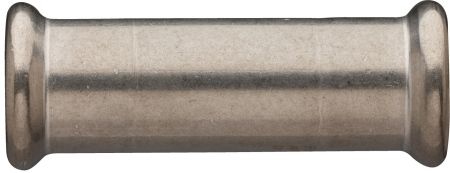
Manguito de paso H/H.