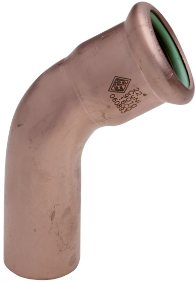
M/F 60° elbow.