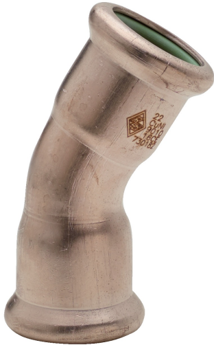
F/F 30° elbow.