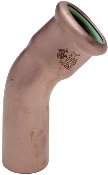
M/F 45° elbow.