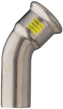
M/F 45° elbow.