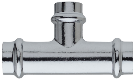
Copper F/F/F reducing tee.