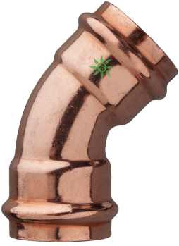
Copper F/F 45° elbow.