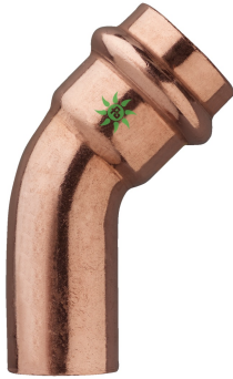
Copper M/F 45° elbow.