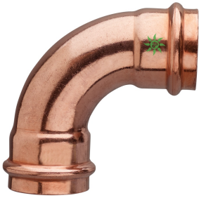
Copper F/F 90° elbow.