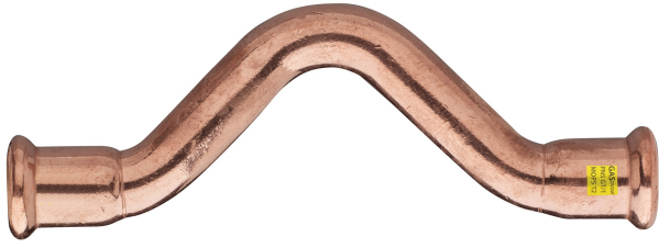
Copper F/F full crossover.