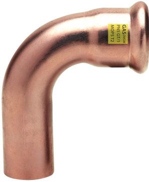
Copper M/F 90° elbow.