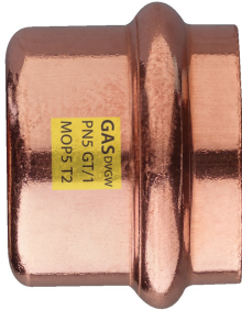
Copper F plug.