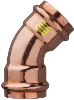
Copper F/F 45° elbow.