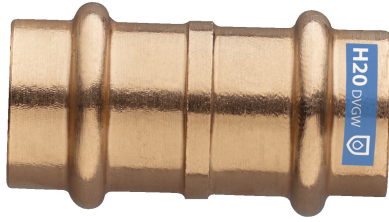
Bronze F/F adapter.