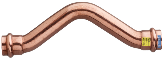
Copper F/F full crossover.