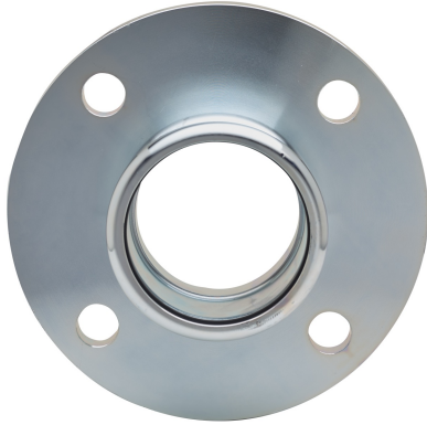
PN16 F flanged joint.