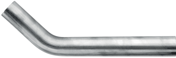
M/M 45° bend.