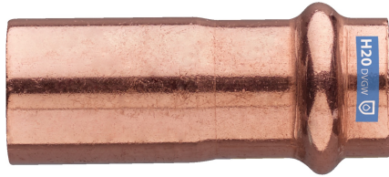
Copper M/F reducer.