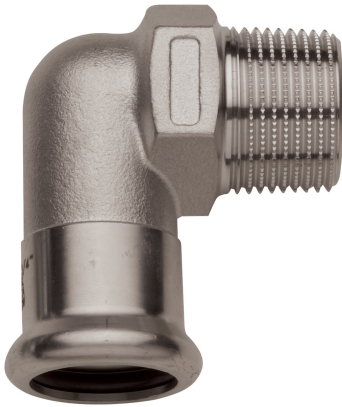
Winkeladapter 90° AG.