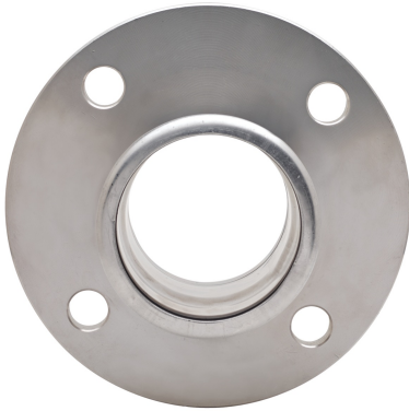
Flanschadapter I PN16.