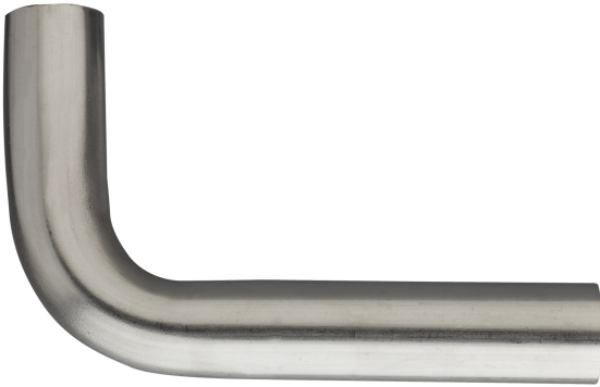
Gebogene Rohrstücke A/A 90°.