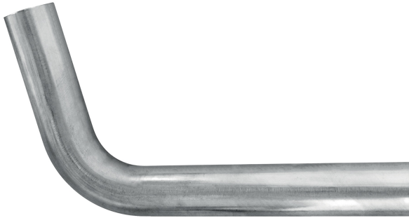
Gebogene Rohrstücke A/A 75°.